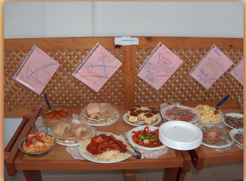
EPMagazine Meeting, 25-th April 2012, Sambata de Sus